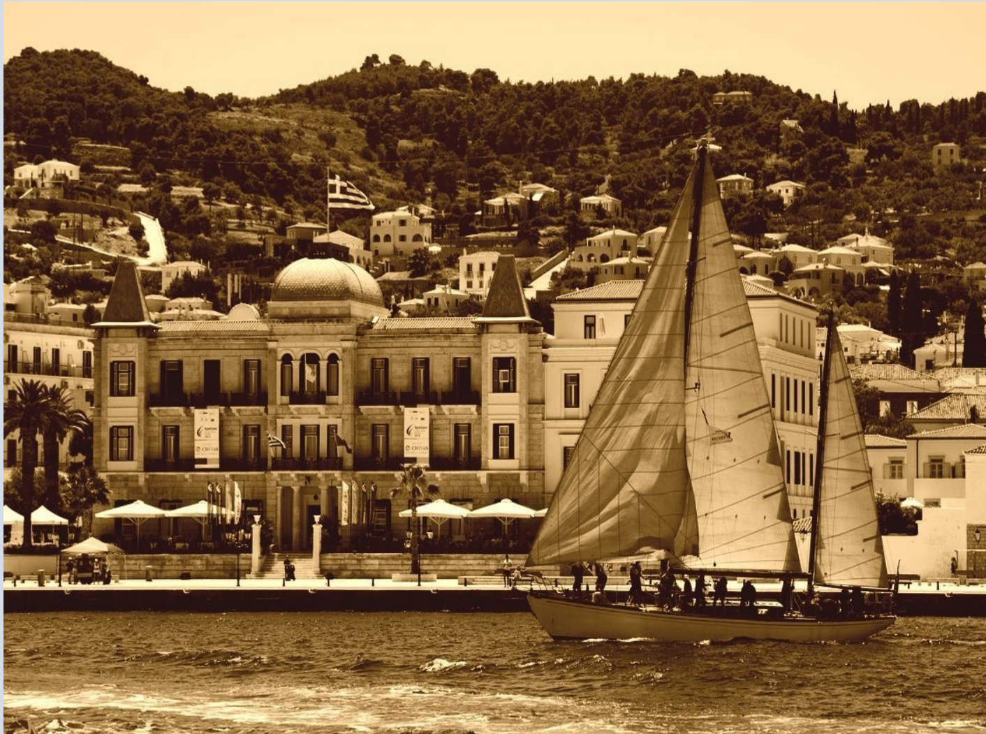
The Posidoneion Hotel in the main Harbor — built in 1914