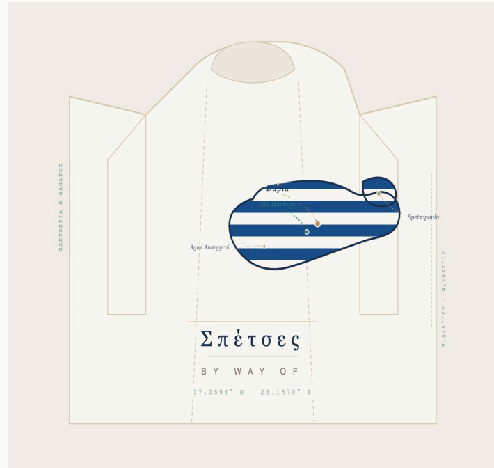
Island Map · Greek Flag

The outline of Spetses overlaid with the Greek flag — placed centre-back as a bold statement.