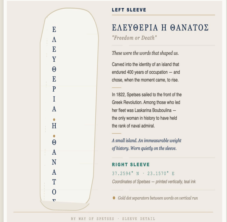
Left & Right Sleeve Detail

"Freedom or Death" These words run the length of this sleeve and won us our country back. They still live in every person, every stone, every harbour, every wave in Spetses.